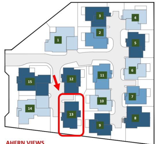
AHERN VIEWS 74 Ahern Road, Pakenham