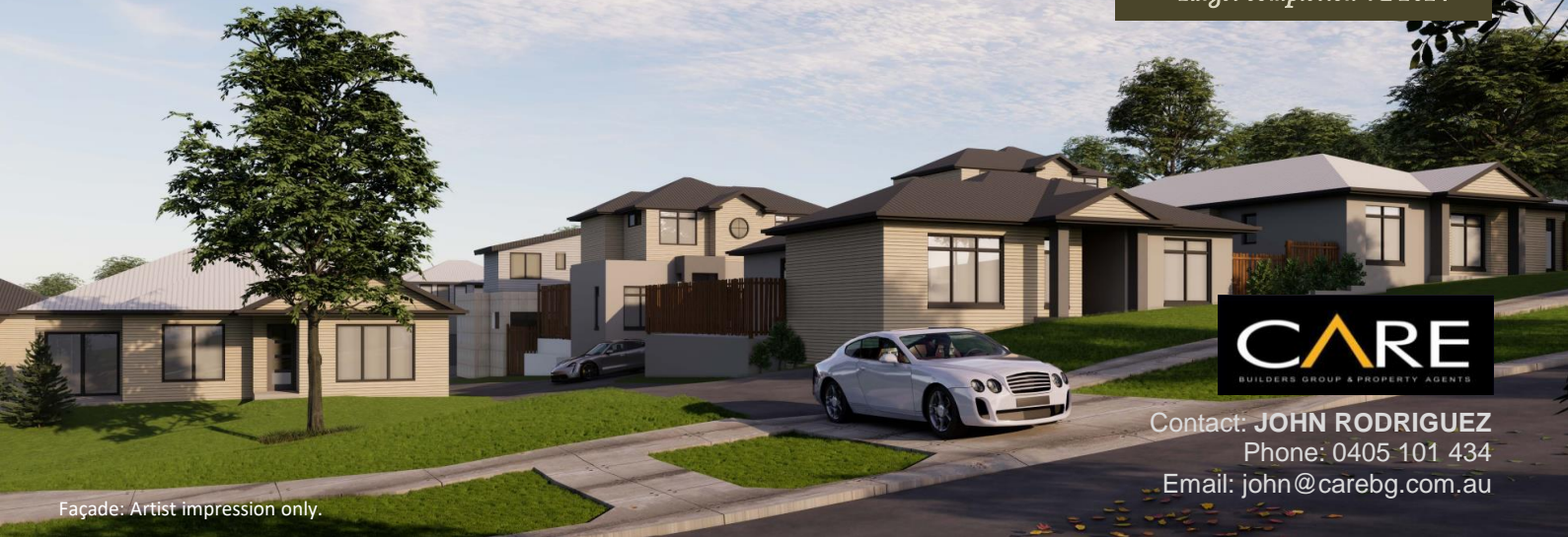
Façade: Artist impression only.