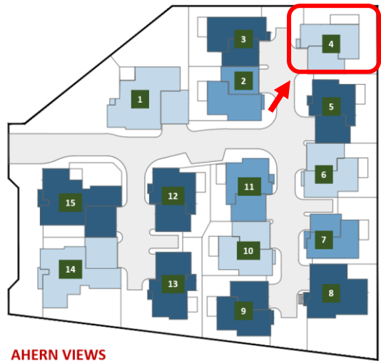
AHERN VIEWS 74 Ahern Road, Pakenham

For as low as 5% deposit No progress payments