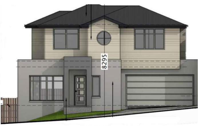
Floorplan from endorsed council plan

Double storey | Bedroom 3 | Bathroom 2.5 | Garage 2